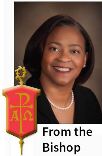
From the Bishop

Overlook Retreat and Camp Ministries (Camp Overlook) is seeking to fill the position of Assistant Director/Program Director. The Assistant Director will work closely with the Executive Director and have the primary responsibilities of designing/implementing camp programs for various age groups, implementing and overseeing our summer programs, recruiting staff, promotion and advertising for programs and support the overall mission of Overlook with other tasks as they arise. For details, visit the Virginia Conference website at www.vaumc.org/jobs .