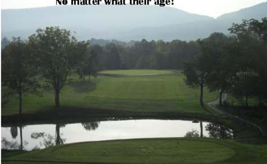
Shenvalee Golf Resort, New Market, VA

Golfers for God's Kids.... No matter what their age!