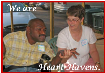
Rehoboth UMW @ Perkins

Currently Heart Havens has 10 homes in 8 Districts across the state. Thousands of individuals are in need of housing and services in Virginia. Heart Havens' goal is to address these needs by continuing to build homes and provide services.