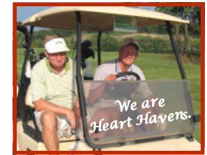
Farmville UMMen's 1st Annual Golf Tournament

Socializing beyond one's immediate family is important to everyone. Individuals enjoy the company of their neighbors, coworkers, and associates. Our friends in The United Methodist Church are wonderful hosts and hostesses for many social activities, and help bridge the gap between residents and the community.