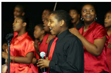
Galilee Youth Choir performs during the closing worship on Wednesday.

For more information or to hear sermons from the 227th Virginia Annual Conference the conference webpage at www.vaumc.org .