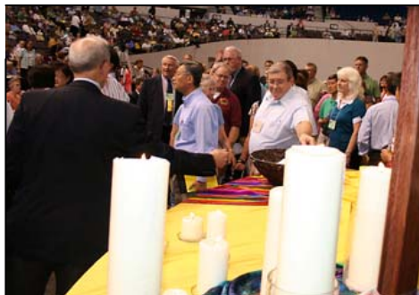
Churches bring covenants to participate in Five Talent Academy to the altar at Annual Conference.