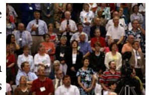
Members of Annual Conference stand to sing

More news can be found at the conference home page, www.vaumc.org . You can also find information about ordering DVDs of the various sessions.